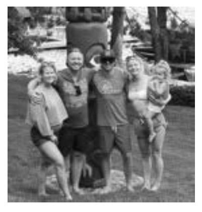
First place, Nacho Problem

What a day we had this year. We had our start at Church Island and a very quick detour to Ruttger's for pizzas to wait out the weather and a restart at 4 p.m. It was another fantastic BAY LAKE AMAZING RACE with 26 teams completing nine challenges with a photo opportunity at the totem pole. The event raised $6,420 in entries and donations for BLIA!