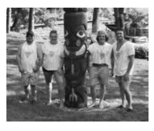
Second place, Cheeta With Wings