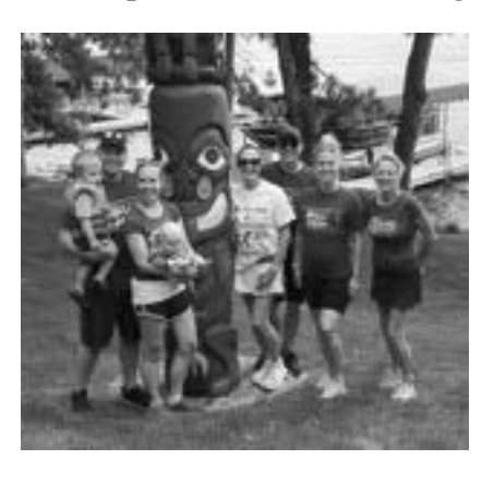
Third place, Bud Light Camp